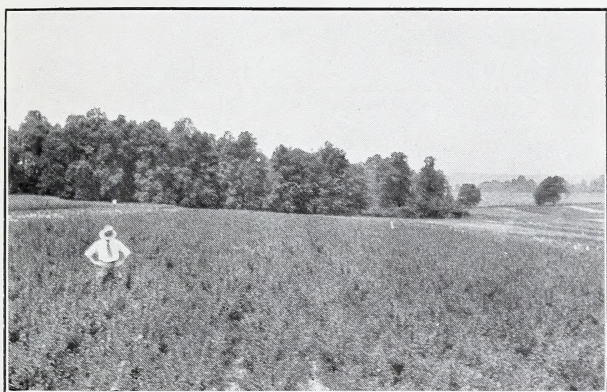
Far and wide goes this block of ROSA HUGONIS